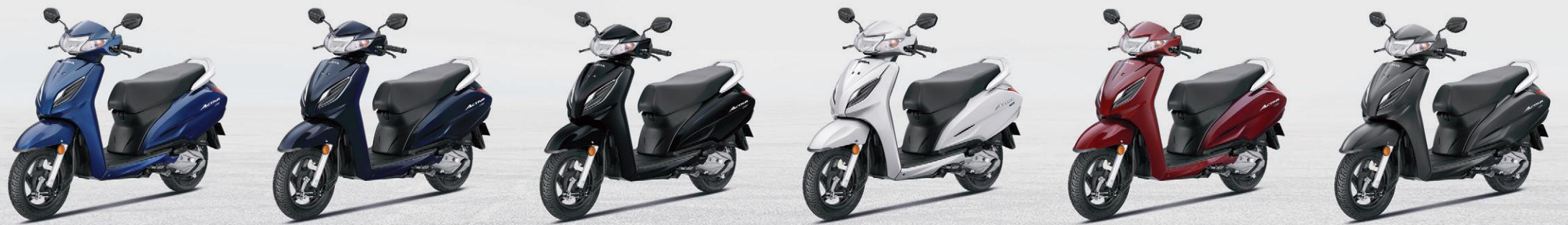
Decent Blue Metallic Pearl Siren Blue Black Pearl Precious White Rebel Red Metallic Mat Axis Grey Metallic

•+The technical specifications and design of the vehicle may vary according to the requirements and conditions without any notice • Activa meets Bharat Stage VI norms • Product shown in the picture may vary from actual product available in the market • Accessories shown in the picture are not part of standard equipment • The technical specifications mentioned are for Smart Key variant • All features may not be part of all variants • #Source: Cumulative sales figure of Brand Activa from June 2001 to June 2023. • **Conditions apply